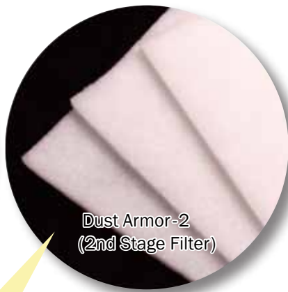
Dust Armor-2 (2nd Stage Filter)