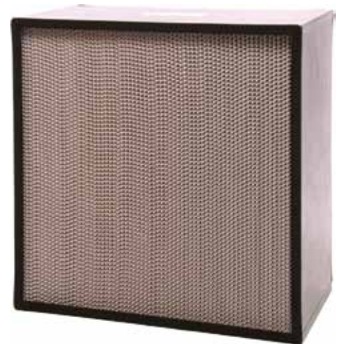
< Full View of the HEPA Filter >