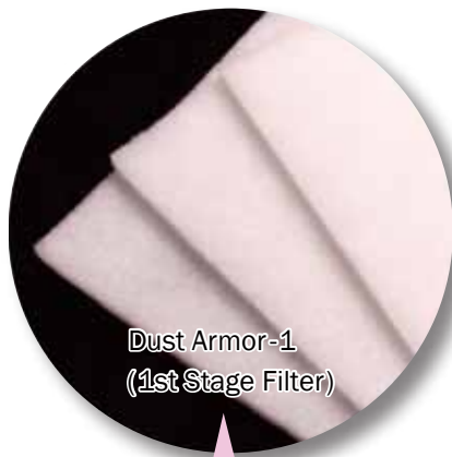
Dust Armor-1 (1st Stage Filter)

HEPA Filters, 1st Stage and 2nd Stage Filters are exclusively for negative pressure air filtration equipments used at Asbestos (ACM) Abatement, Lead Based Paint (LBP) Removal Projects.