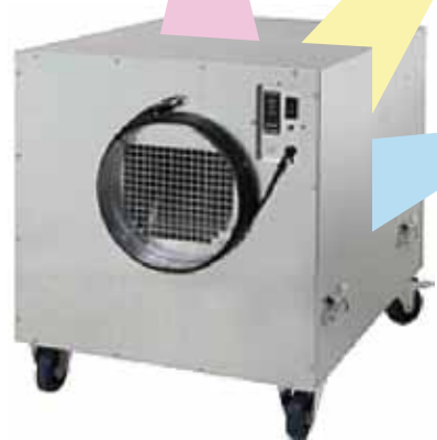
< H2000 Type Negative Air Machine >